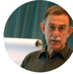
DENİZ SARAL FERROCOM INVESTMENT CORP