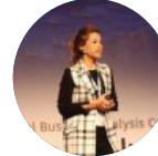
PINAR CINALI BA-WORKS