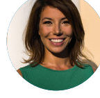
CANAY ATALAY HUMAN WORKS DESIGN